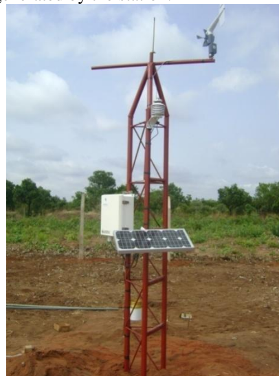
Figure 1: The NECOP Station

(NECOP) instrumentation. NECOP is a project designed by National Space Research and Development Agency (NASRDA) Centre for Basic Space Science (CBSS) to establish a network of meteorological and climatological observing stations spatially located across Nigeria with the aim of setting up such a network of stations to carry out in - situ measurements of meteorological and climatological variables in real time with an update cycle of five minutes [3]. Data from the Nsukka station was used in the course of this work. Relevant parameters for this work are the ambient temperature and the solar radiation data out of the nine variables being generated by the station.